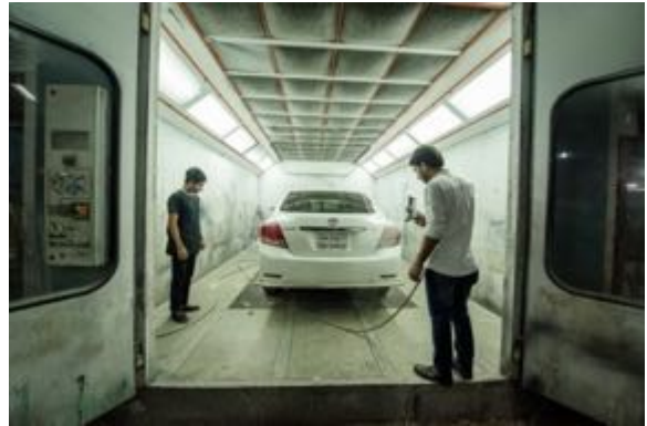
Paint work ongoing in fully equipped paint booth

No single automotive trader in Bangladesh has such comprehensive workshop and support engineering facilities at one place, which will cater all the technical needs of the customers. This facility is now being considered to be expanded and optimally used for other commercial/Industrial operations, like reconditioning of automotive vehicles, using the bonded house concept. Haq's Bay is also