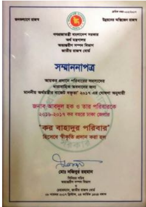
Pic: “কর বাহাদুর পরিবার” recognition from the Govt. of Bangladesh