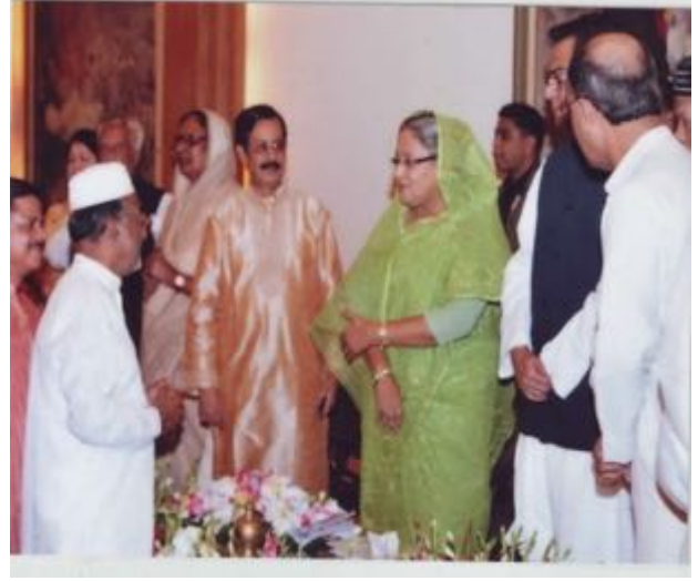
Pic: Exchanging pleasantries with the Hon. Prime Minister of Bangladesh, Sheikh Hasina