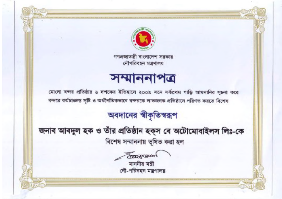
Pic: Recognition letter from the Hon. Shipping Minister of Bangladesh for exemplary role played in Reopening of Mongla Port