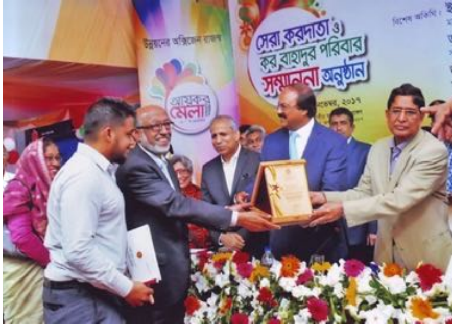
Pic: Receiving recognition from the Govt. of Bangladesh for “কর বাহাদুর পরিবার”